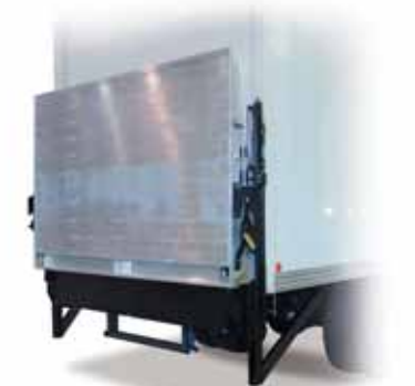
Aluminum platform model in "stored" position