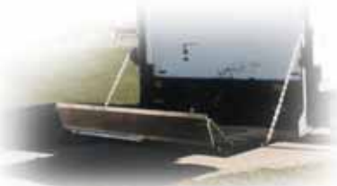
Optional retention ramp