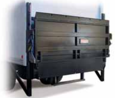
Steel platform model in "stored" position

Provides long life with greater reliability than cable drive.