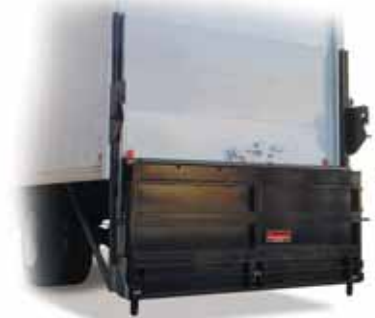
Steel platform model in "dock load" position