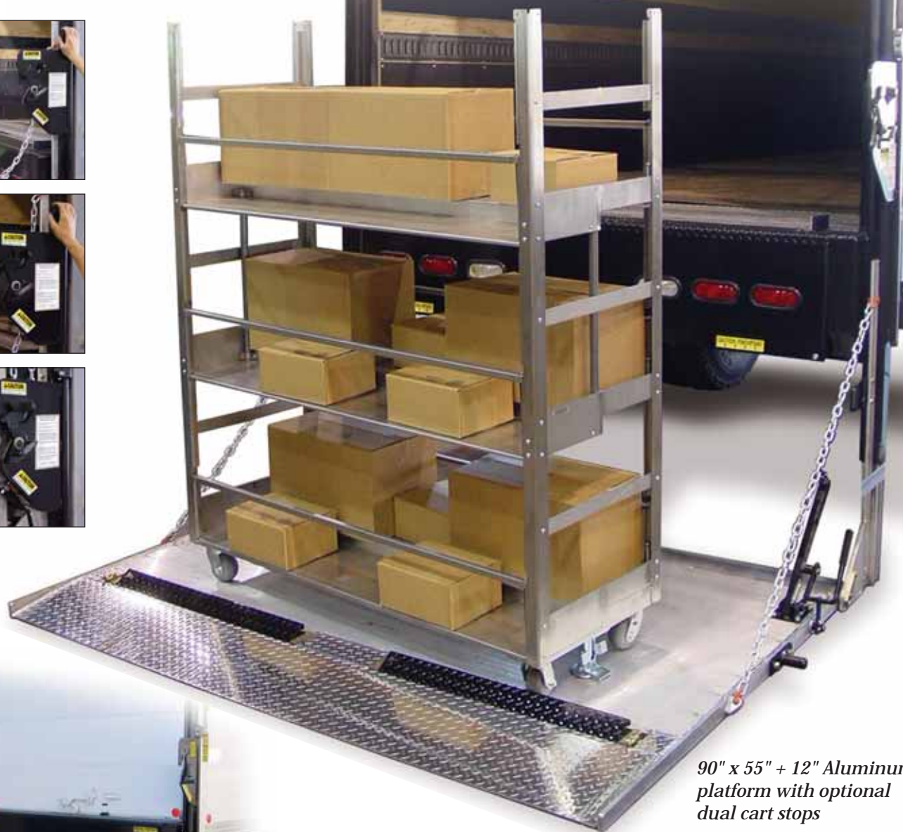
90" x 55" + 12" Aluminum platform with optional dual cart stops