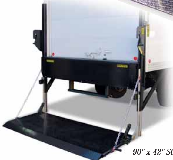
90" x 42" Steel platform with 6" ramp