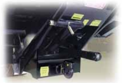
Optional 5 & 12 ton Pintle Hook Brackets