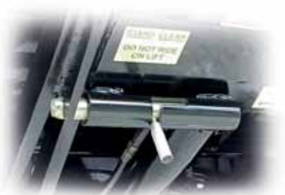
Easy access and highly visible, heavy-duty Latch Pin Assembly positively secures gate in closed position. This Anthony standard feature is the strongest and most visible latch in the industry.