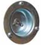
Recessed Toggle Switch (optional)