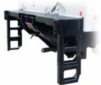
Optional maximum duty dock bumper with third step add-on