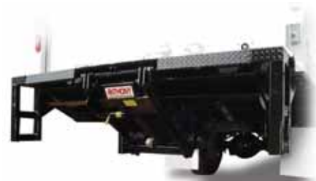
AST in stored/travel position, shown with optional dock bumpers

* NOTICE: Some models of Anthony Liftgates may be provided with step devices to assist the ingress and egress of the truck or trailer rear. These devices are NOT to be considered ALL INCLUSIVE of any requirements or guidelines regarding proper ingress and egress of trucks and trailers. These items are provided as only an added feature for installers to help simplify the meeting of possible ingress and egress requirements. As there are many variables in truck sizes and shapes, it is the installer's responsibility to determine proper ingress and egress requirements, such as steps and hand grips, for each vehicle receiving an Anthony liftgate.