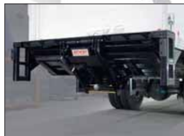
Optional dock bumpers and rubber bumper pads