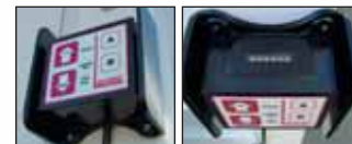
Optional Low Voltage Control Switch saves downtime.

★ AST-Plus covers both Low and High Bed Heights from 38" to 56" in one complete package.