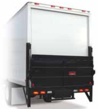
Standard Model in "stored" position

* NOTICE: Some models of Anthony Liftgates may be provided with step devices to assist the ingress and egress of the truck or trailer rear. These devices are NOT to be considered ALL INCLUSIVE of any requirements or guidelines regarding proper ingress and egress of trucks and trailers. These items are provided as only an added feature for installers to help simplify the meeting of possible ingress and egress requirements. As there are many variables in truck sizes and shapes, it is the installer's responsibility to determine proper ingress and egress requirements, such as steps and hand grips, for each vehicle receiving an Anthony liftgate.