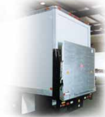
Optional aluminum platform