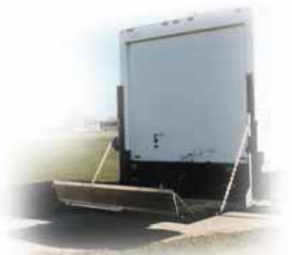
Optional retention ramp