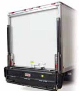
RailTuck Model in "stored" position